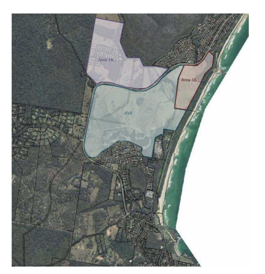
Figure 1: Urban Release Area 14 showing Saint Vincent's Foundation (SVF) land (the subject site)

A location map is included in Part 4 - Mapping.